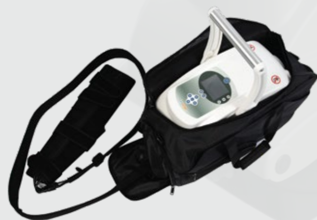
The Moove sport with its carrying bag and his knee splint

Icy water passes through the splint, in combination with a continuous or alternating air pressure, so that the skin temperature goes from 30 ° to 6 ° C on average, which will relieve the treated area and speed up the recovery. limiting drug intake and promoting range of motion.